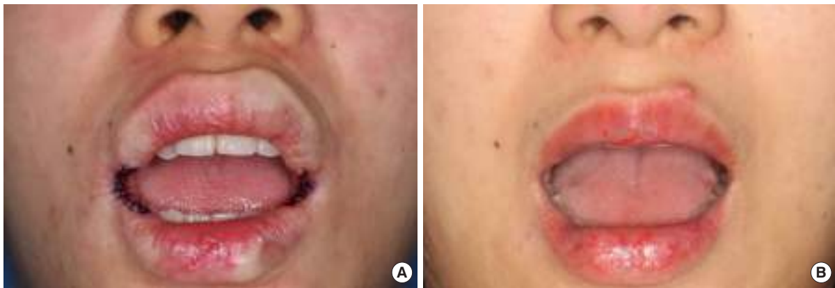
Fig. 3. Postoperative photographs. (A) Immediate postoperative view. (B) After 12 months, the intercommissural distance was 41 mm and mouth opening was 35 mm.